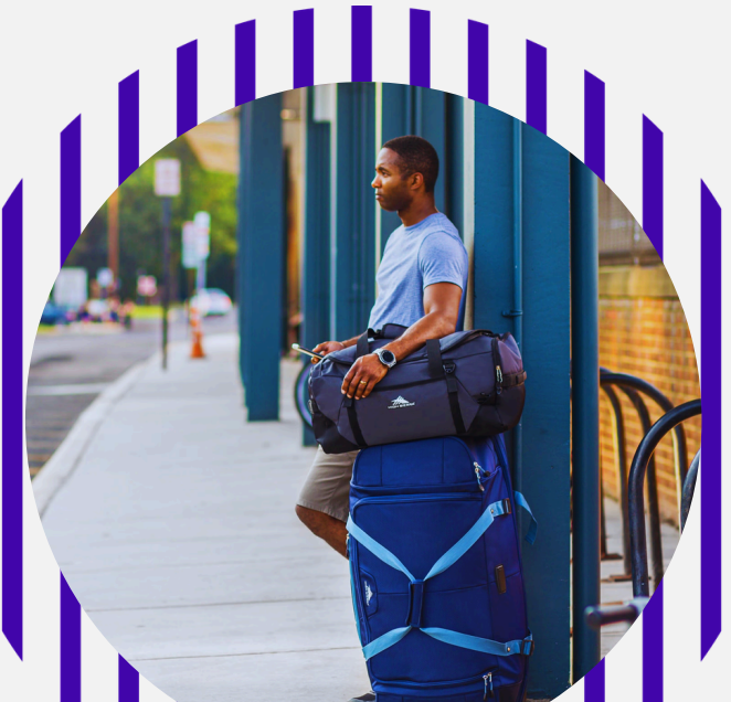
Culture & Appreciation Programs