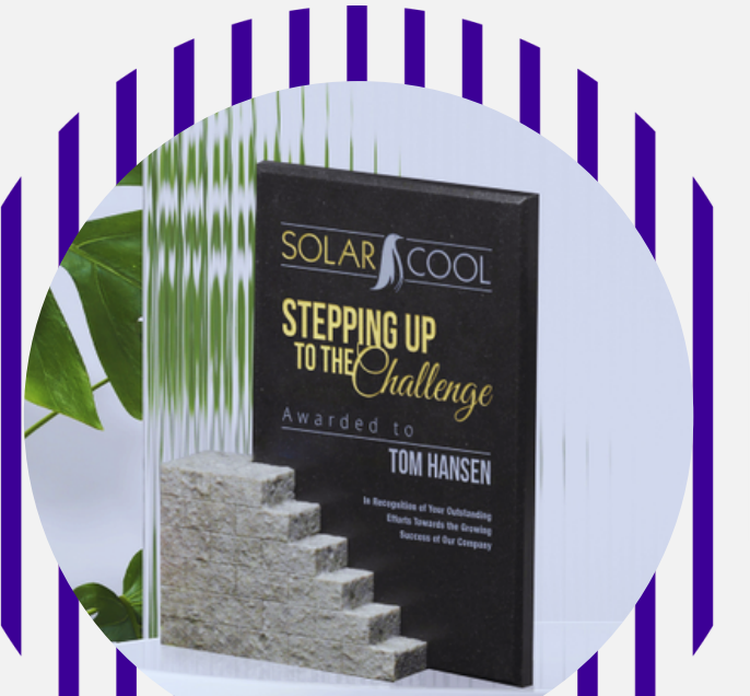
Performance & Incentives